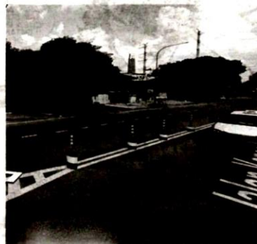
PENGGUNA jalan raya kerap kali membuat pusingan U secara haram di Jalan Kanan 1 hampir setiap masa.