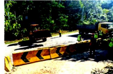
MPS placing concrete barriers to prevent lorries from illegally entering and dumping rubbish at a plot of land along Jalan Sungai Tua Ulu Yam, which was among the hotspots identified.

"We usually see crowds coming in to apply or renew licences at the end of year when their licences are