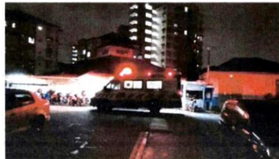
AMBULANS yang membawa jenazah Rosliman. Gambar kanan, jemaah melakukan solat jenazah.

Menerusi perkongsian di Facebook Lembaga Zakat Selangor (LZS), arwah Rosliman dikatakan baru sahaja melaungkan dua rangkap daripada kalimah Azan se-