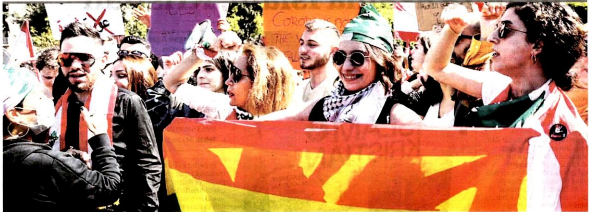
AHLI kumpulan gay, lesbian dan transgender (LGBT) di Lubnan membuat demonstrasi bagi mempertahankan hak kumpulan itu yang sebahagiannya adalah antara gerakan yang didasari oleh gerakan liberalisme agama.