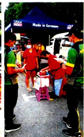
All morning and night markets in Klang, like this one in Jalan Papan that was forced to close at the start of the MCO, can now reopen. (Right) MPK officers conducting a survey on SOP compliance at an open-air market that was allowed to reopen during the recovery phase of the MCO.