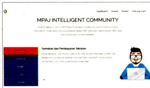
Ampang Jaya Municipal Council is directing people to use the MPAJ Intelligent Community online portal for council matters.